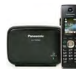
TGP600 Cordless DECT